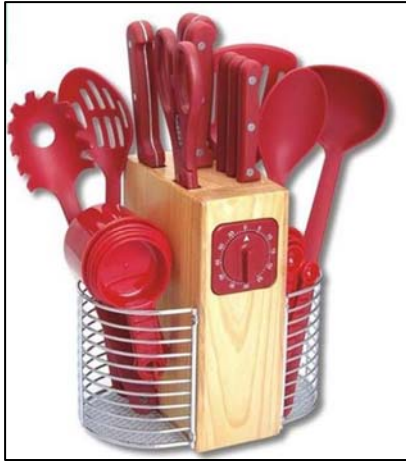
25 Piece Knife Block Set from Stanley Roberts

Recently joining 230 Fifth Avenue is Stanley Roberts, which was founded in 1957, and has been a leading supplier to the housewares industry ever since. They currently have 4 divisions consisting of: cookware, cutlery, flatware and ceramics. All divisions feature a good-better-best assortment to fit the needs of all customers.