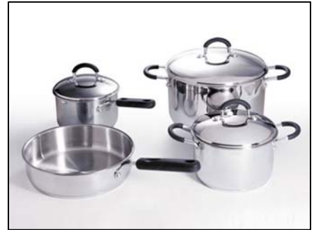
7 Pc. Professional Stainless Steel Cookware from Stanley Roberts

Some of their newest products include their 25 Piece Knife Block Set and their 7 Piece Professional Stainless Steel Cookware, shown in the images. The Knife Block Set never needs sharpening and conveniently includes cutlery tools, measuring cups and spoons in a stylish wood block with a kitchen