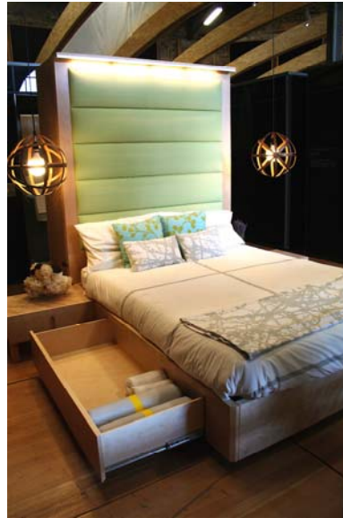
Capi Storage Bed by Roomy Home Interiors

Due to the success of its Canadian retail showroom, Roomy Interiors has now expanded its operations into Manhattan at the 230 Fifth Avenue New York MarketCenter™ in Suite 1401.