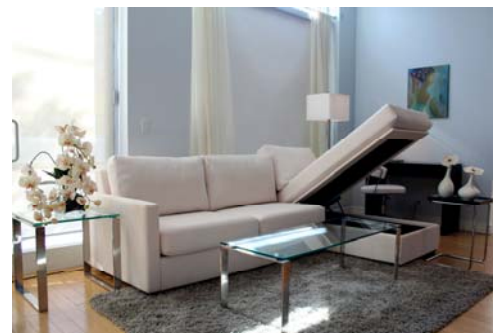
Monroe Compact Sectional by Roomy Home Interiors